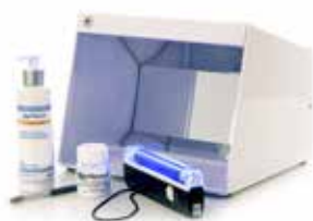
KlerReveal Operator Training Kit