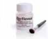
KlerReveal Red UV Glow Powder