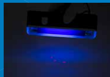
Surface wiping techniques

FOR FULL PRODUCT ORDER CODES, PLEASE VISIT OUR WEBSITE.