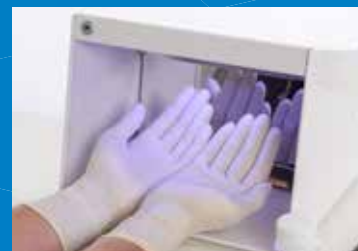
Cleanroom glove integrity