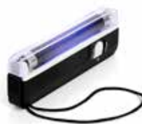
KlerReveal Hand Held 4W UV Torch