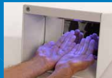
Hand hygiene technique and effectiveness